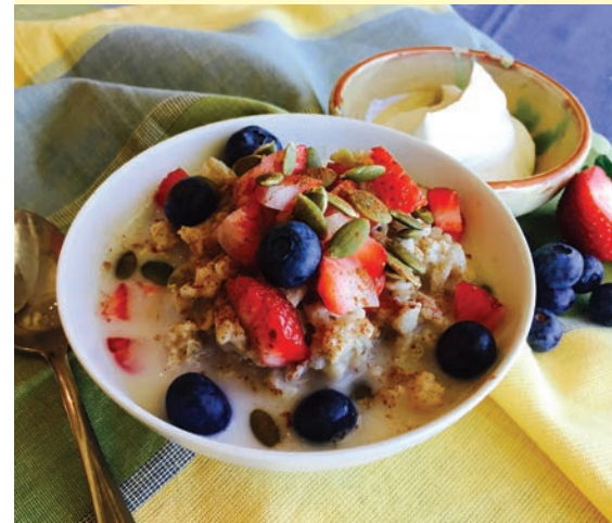
Power Oatmeal with Berries