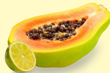
Curried Turkey Salad