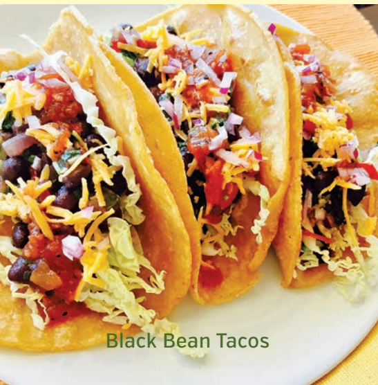
Black Bean Tacos

Note: If you wish to use the large broccoli stem, cut off the bottom 1 inch of the stem. Peel the tough skin off the stem. Chop stem into 1/4 inch pieces and cook with the rest of broccoli.