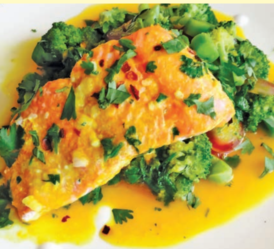
Turmeric Glazed Salmon

Whisk all dip ingredients together in a small bowl. Serve with crudites.