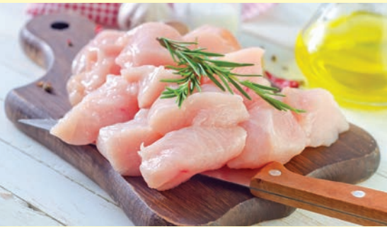
Shiitake Sesame Chicken Rice Bowl