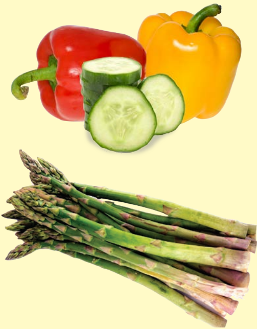
Seafood Asparagus with Ginger Orange Sauce

1/2 cup cucumber slices 1/2 cup bell pepper slices